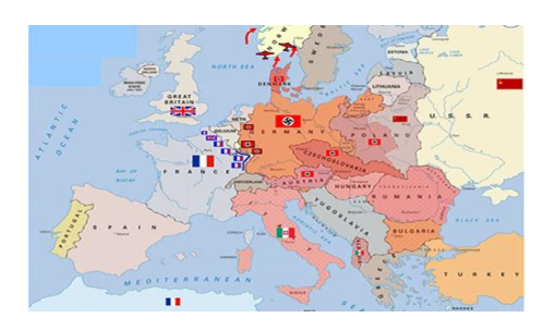
World war II: Political and strategic analysis