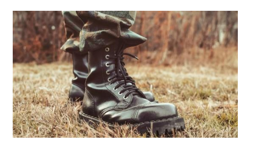
War in the Modern World: Strategy, Weapon Systems and Tactics