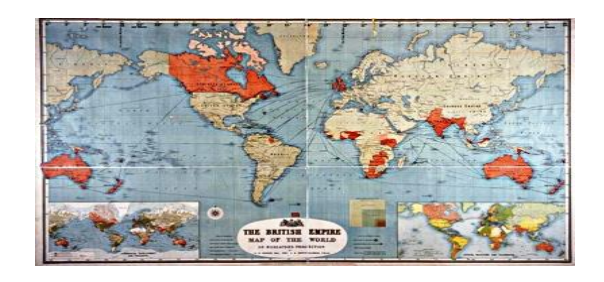
British Politics, 1830–1945