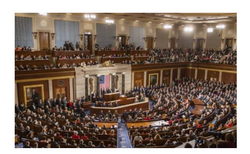
U.S.A. Congress Simulation