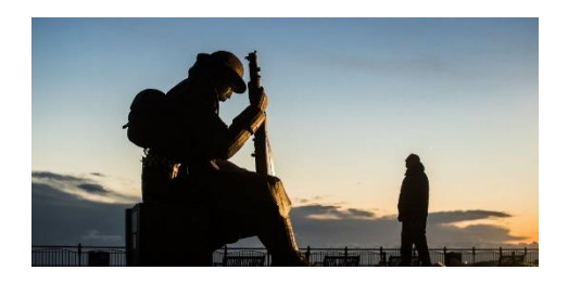
Military Sociology - Military Psychology