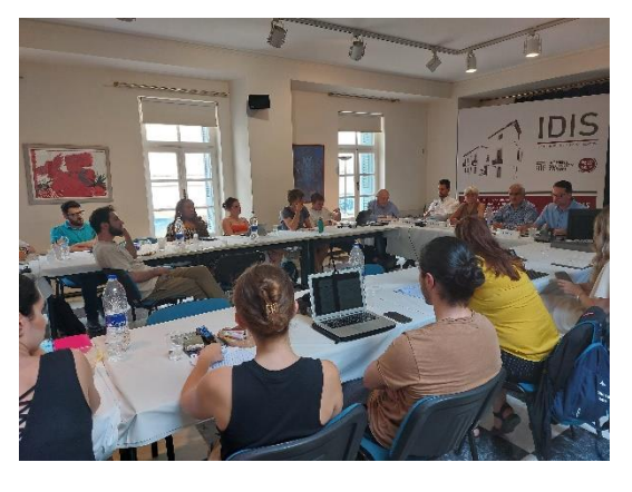
The Seminar was held in cooperation with the Centre International de Formation Europeéne (CIFE) Participants: 22 students from 10 different countries