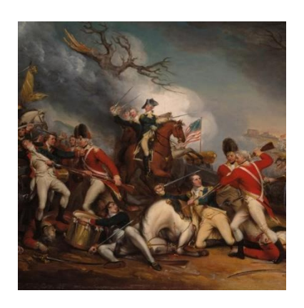
The US from its colonial origins to World War II