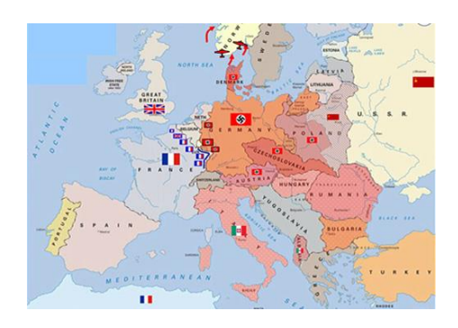
World War II: Political and strategic analysis