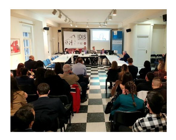
The event was co-organized with Hanns Seidel Stiftung